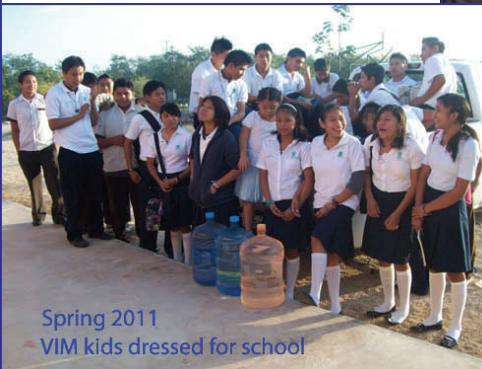
Spring 2011 VIM kids dressed for school

the secondary schools which are not found in their home villages. 28 youth call this "village" home during the week. You can see how happy they are to be going to school!